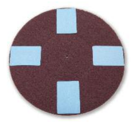
Photo shows Tweeners<sup>™</sup> attached to maroon pads. Maroon pads are sold separately. See page 7.

For Attachment to Maroon Pad OR for Hand Sanding stairs, corners, around vents